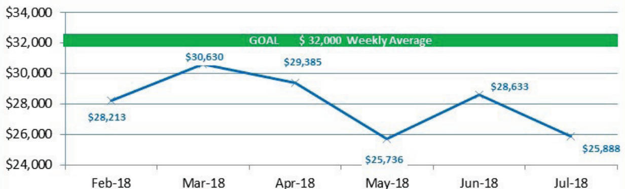
Average Weekly Sunday Offering Collections by Month

*Weekly Collection Goal Assumes Current Church Loan Interest Rate