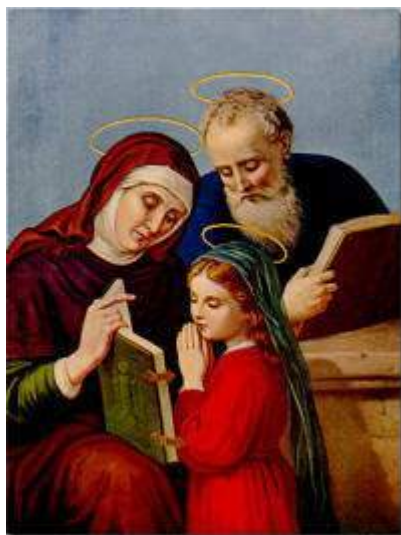
Saints Joachim and Anne, Parents of the Blessed Virgin Mary